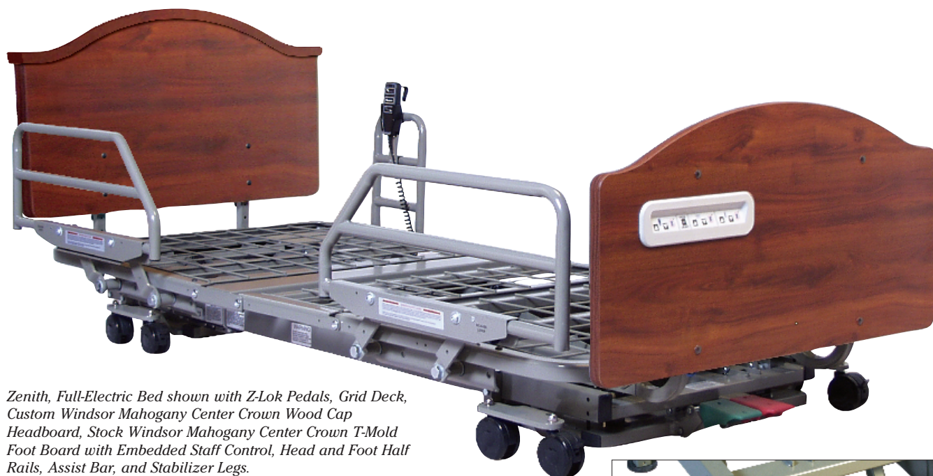
Zenith, Full-Electric Bed shown with Z-Lok Pedals, Grid Deck, Custom Windsor Mahogany Center Crown Wood Cap Headboard, Stock Windsor Mahogany Center Crown T-Mold Foot Board with Embedded Staff Control, Head and Foot Half Rails, Assist Bar, and Stabilizer Legs.